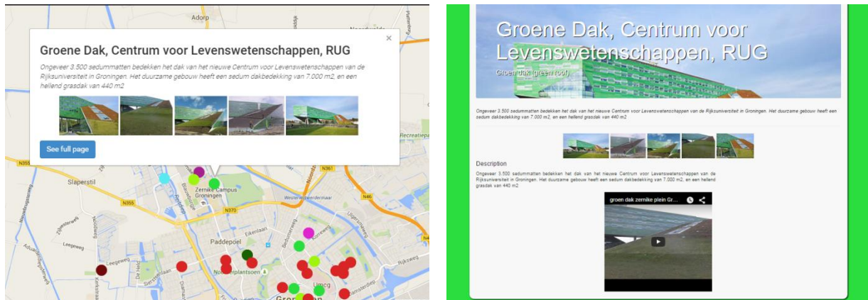
Figure 5: Screenshots showing design on pop-up and full-page information

As alluded to in the introduction, the results and analysis data for much research in this field is in the form of digital media (videos, photographs, maps, diagrams, etc). By far the most effective way to store and share this content is via online platforms. It was found by most of the stakeholders involved that the climatescan.nl application was an ideal resource for managing such research data. Any form of digital data, be it youtube clips of experiments or urban flood maps, can be uploaded and incorporated onto the map. In addition, most of the research data within the theme of urban resilience and climate proofing is location specific which allows research data to be collated for a particular planned or constructed project. Using a spatial API online tool such as Google Maps, allows users to quickly and easily search geographic data in a much more user friendly way than more structured online databases (Bell et al , 2007). It is much simpler and more attractive to zoom in on a map to a known location than search a list of documents.