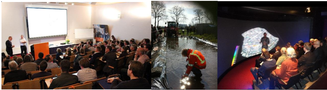
Figure 3: Launch of climatescan.nl in March 2014 with over a hundred participants (left), full scale permeable pavement test (middle) and 3D visualisation of flood mapping and heat stress in Groningen (right).