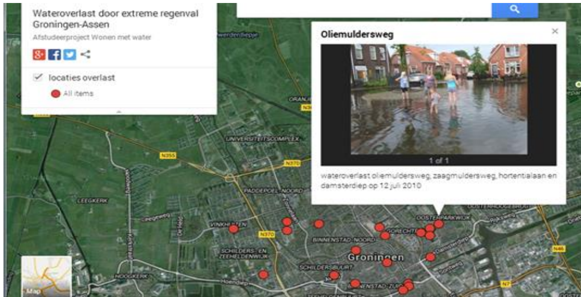
Figure 2: Snapshot of Groningen Wetspots Map

The climatescan.nl application utilises the free Google Maps platform which was chosen as it is the most popular online mapping service and is arguable the unofficial industry standard. Most internet savvy users are very familiar with this service and are able to easily manoeuvre around such a site. In addition, Google Maps has a free service (Google Maps API) that allows developers to integrate the maps into their external websites on to which specific data can be overlaid.