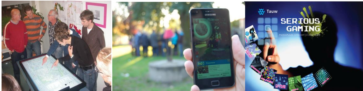
Figure 1: examples of interactive tools to promote engagement with stakeholders: touch tables, augmented reality and serious gaming

and related environmental issues. Examples of tools that are used on an international scale are: 2D/3D flood visualisation (e.g. Blanksby et al., 2012, Verlaat et al., 2015), ‘serious’ games (Jefferies et al., 2012, augmented reality (Boogaard et al., 2012), an immersive and non-immersive 3D virtual city: decision support tool for urban sustainability (Isaacs et al., 2011) and interactive sessions with tools like a touch-table (Figure 1).