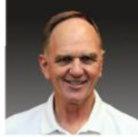
Case Runolfson Retired USA