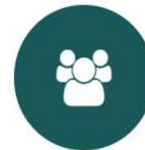
Exchangeteams aan het werk