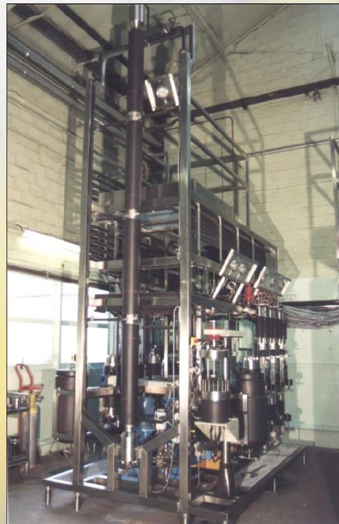
Separex pilot-SFE extraction/fractionation unit

Supercritical fluid extraction of phytochemical secondary plant metabolites from the Andes Lupin.